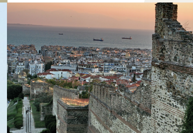
Byzantine Walls / Ano Poli

Home of Kemal Ataturk http://www.tcvb.gr/index.jsp?CMCCode=10030412 &extLang=LG