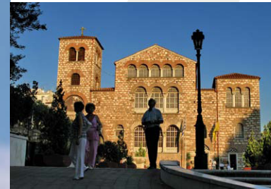
Church of Agios Dimitrios