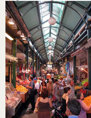
Kapani or Agora Vlali