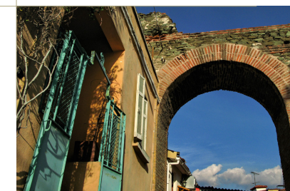
"Portara" / Ano Poli