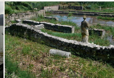
The ancient city of Dion