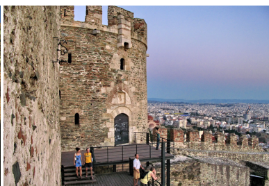
Trigoniou's Tower / Ano Poli