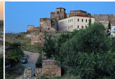
Yedikule or Heptapyrgion / Ano Poli