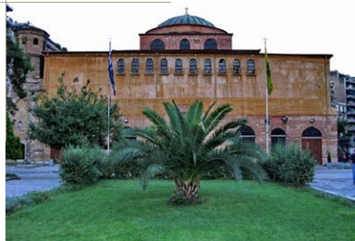
Church of Agia Sofia

http://www.tcvb.gr/index.jsp?CMCCode=10030302&extLang=LG